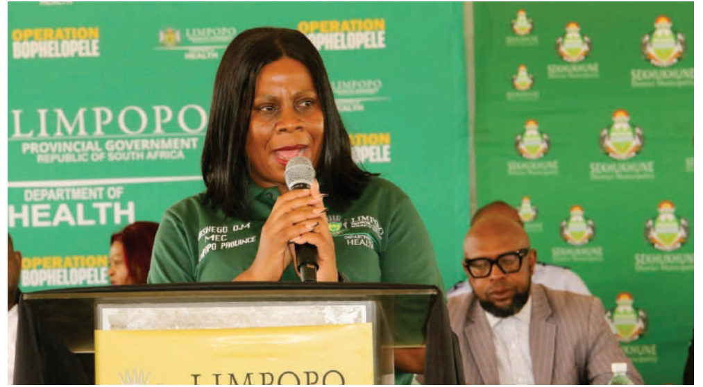
MEC for Health in Limpopo, Dieketseng Mashego, addressing the Provincial World Mental Health commemorated at the Mighty Blues Sports Ground in Moganyaka Village, EPMLM.