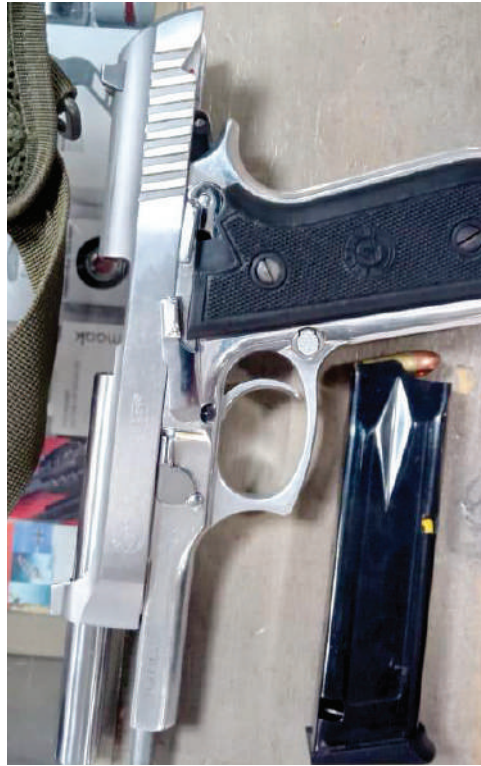
Unlicensed firearms were recovered by the police during the Operation Shanela conducted across Limpopo Province.