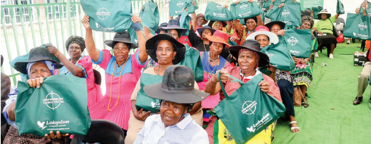
Elderly persons from different walks of Elias Motsoaledi converged in number to commemorate the International Day of Older Persons, held at the Municipal Gardens in Groblersdal on Friday 24 October 2025.