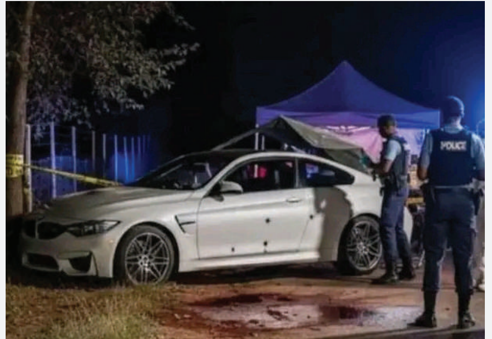
The Police in Jane Furse are investigating cases of murder and attempted murder after a BMW driver was fatally shot and his accomplice injured at Madibong Section.