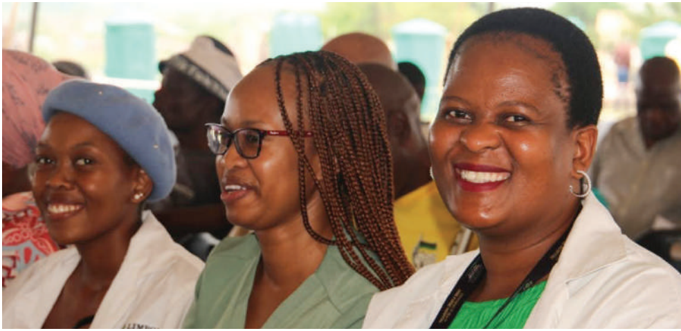
Residents from different villages of EPMLM attended in large numbers during the Limpopo Provincial World Mental Health Commemoration, held at the Mighty Blues Sports Ground in Moganyaka Village, within the EPMLM.