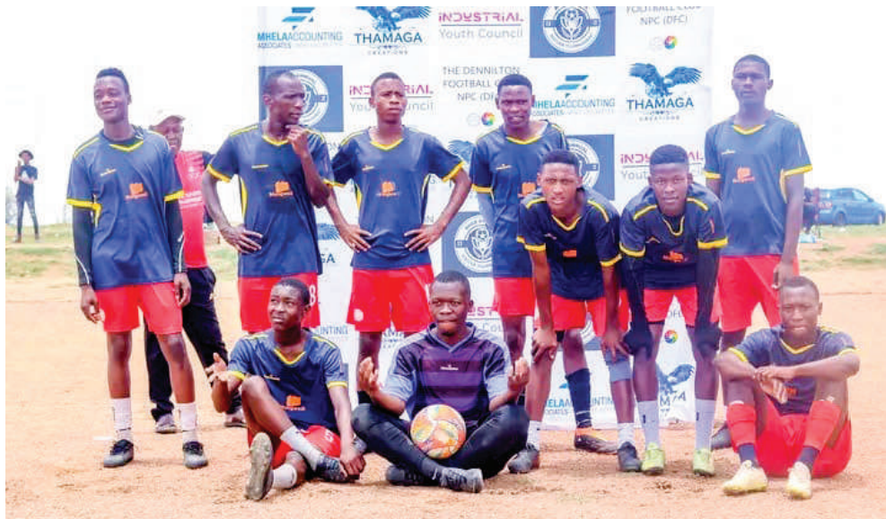
Real Eagles FC players are happy to form part of Sekhukhune Regional Nedbank Championships playoffs which will see them participating in the Nedbank Cup provincial knockout games.

SEKHUKHUNE - The Sekhukhune Regional Football League Nedbank Cup competition heated up over the weekend, Saturday 26 and Sunday 27 October 2025, with only three teams remaining in the running.