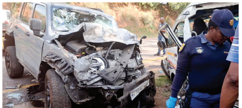
The tragic road accident scene at the R540 near Dullstroom that claimed the lives of seven lives of people, including six community members of FTLM.

for the survivors and the families of the deceased.