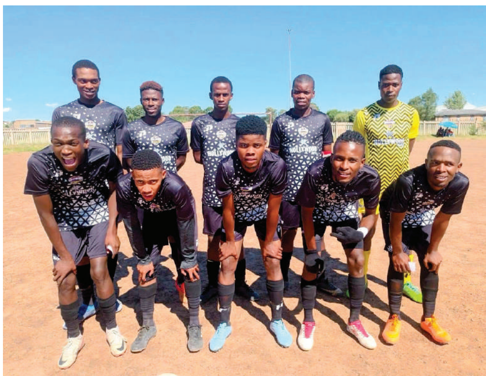
Mpheleng Zebras FC are part of hopeful teams however eliminated in the preliminary rounds of the Nedbank Cup in Sekhukhune Region.