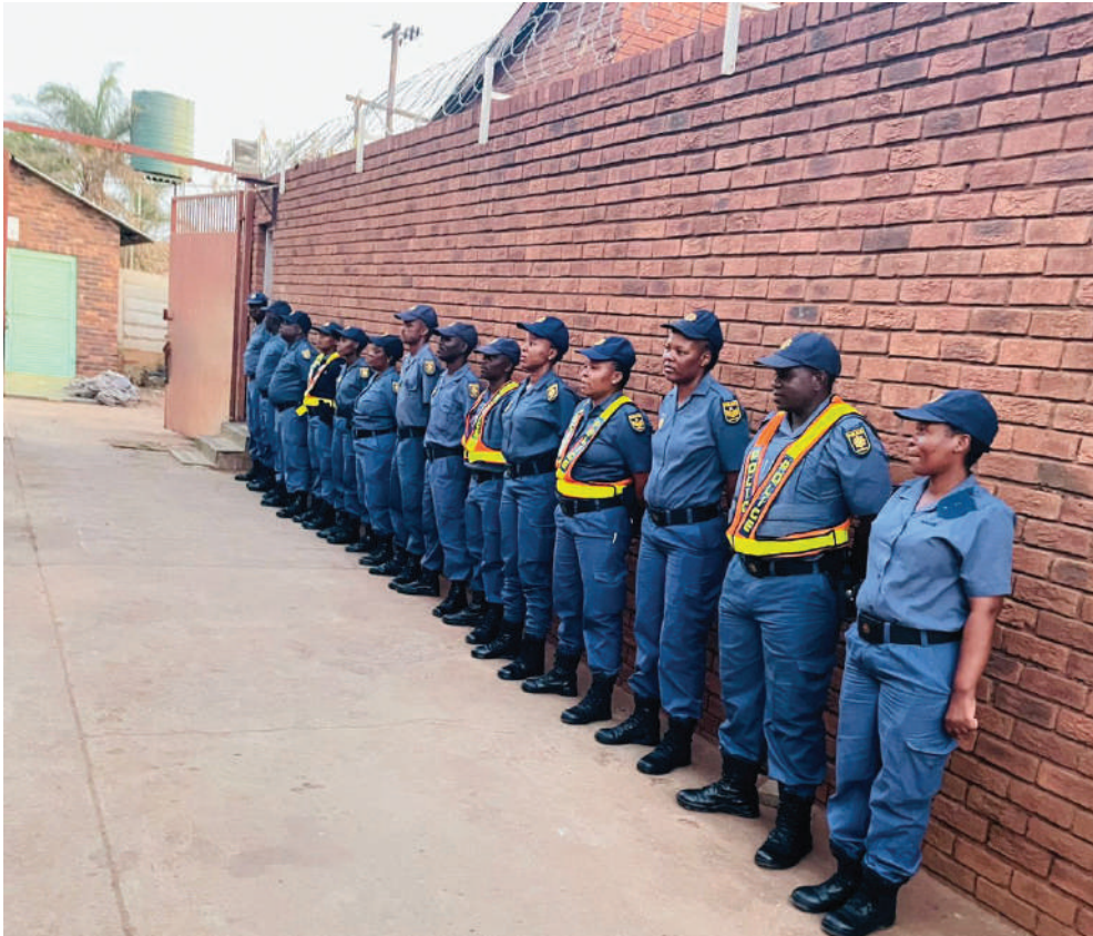
The multi-disciplinary law enforcement teams gearing-up to conduct the high density Operation Shanela, which resulted in the arrests of 823 suspects.

Acting Provincial Commissioner of the Police in Limpopo, Major General Jan Scheepers, praised the dedication of police officers and community stakeholders, stressing that the police will continue to prevent, combat, and investigate crime, maintain public order, and protect all people's lives and property.